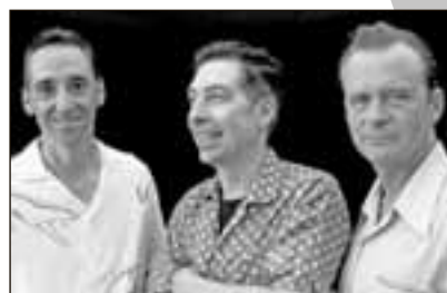
11/11-12 The Bel Airs