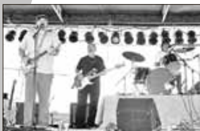
11/4-5 Earl and Them

9pm Showtimes 3 Bands, 6 Big Weekend Nights