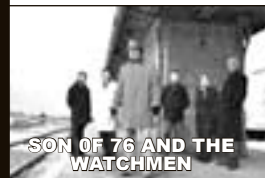
SON OF 76 AND THE WATCHMEN

$1 off Admission and $1 off first Drink for BSO Members (not valid on drink specials)