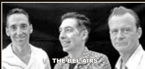
THE BEL AIRS