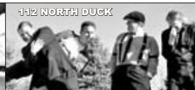
112 NORTH DUCK