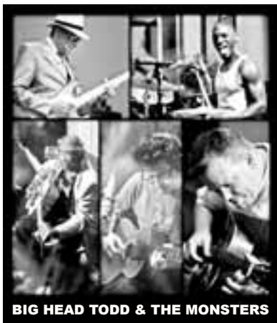
BIG HEAD TODD & THE MONSTERS

VOLUME FIFTEEN, NUMBER THREE • MARCH 2011