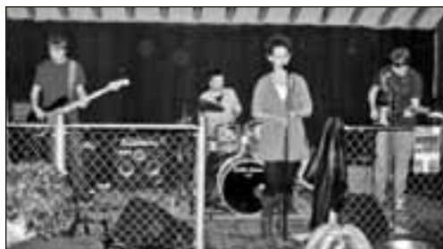
BluesEd bands: Mojo Bag, Crimson Dawn, and Us and Them. Our new students are: