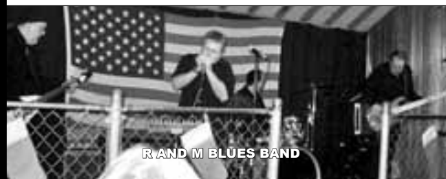
R AND M BLUES BAND

No cover for all shows and shows start about 9 $1 off first Drink for BSO Members (not valid on drink specials)