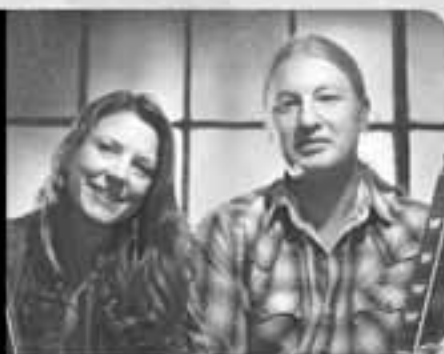
DEREK TRUCKS & SUSAN TEDESCHI BAND