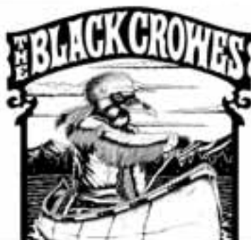
THE BLACK CROWES