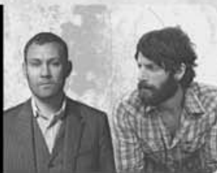
DAVID GRAY & RAY LAMONTAGNE