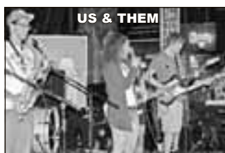
US &amp; THEM