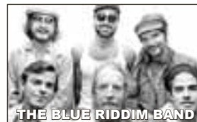
THE BLUE RIDDIM BAND