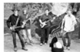
Cold in Hand Chicago, Delta, & Funk Blues

$15.00 Admission Includes one FREE glass of JAV Wine