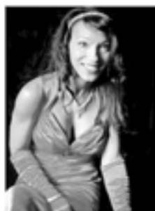
Physha Jazz, Rhythm & Blues