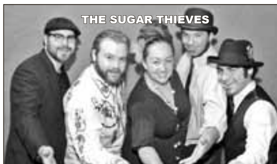
THE SUGAR THIEVES