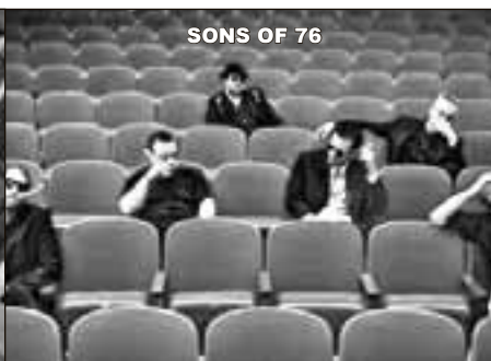
SONS OF 76